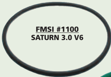
FMSI #1100 SATURN 3.0 V6