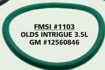
FMSI #1103 OLDS INTRIGUE 3.5L GM #12560846