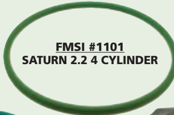
FMSI #1101 SATURN 2.2 4 CYLINDER