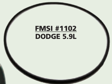
FMSI #1102 DODGE 5.9L