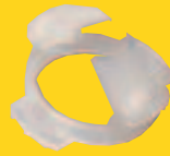
3106 (1/4) 3107 (trans)