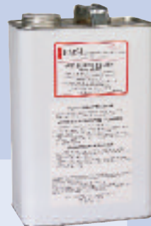
FMSI Quick Dry Flush Solvent 128oz. Gallon FMSI #AR4202

Flush Gun Condensers, Evaporators, Hoses etc. FMSI #AR6223